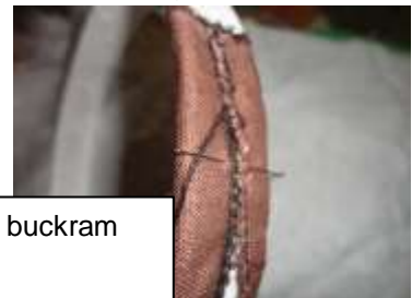
(Sewing the lining onto the buckram base.)