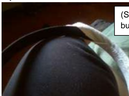
(Sewing the embroidered piece to the buckram.)