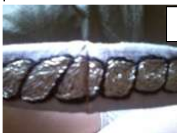
(Sewing the end of the piece together)